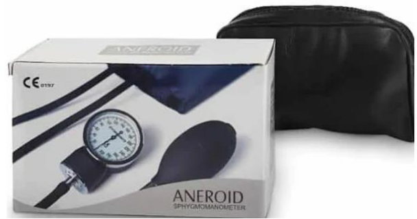
Blood pressure tester