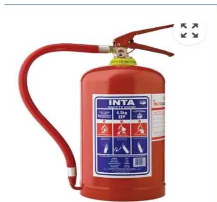
Fire extinguisher 4.5Kg