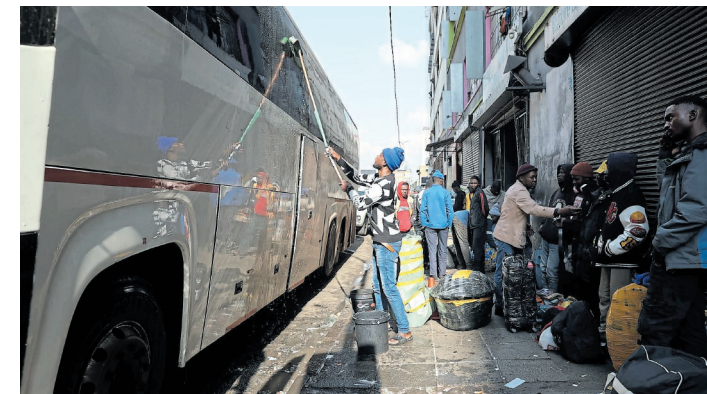
Malawian nationals who were stranded at the embassy in Sandton wait to be repatriated to Malawi