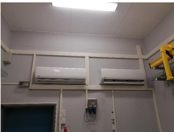
Figure: Existing Air conditioners

There is space for the 2-x new floor standing air conditioners at Yzerfontein as per below picture. The fire extinguisher and EAS may need to be moved potentially.