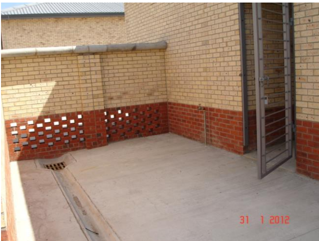
Figure: Courtyard for outdoor units

Piping, AC power for the outdoor units to be placed as per existing piping and cabling in the wireways. The outdoor units of the air conditioners to be installed in the courtyard where the existing outdoor units are currently installed as depicted by Telkom/Openserve who is the landlord of the facility.