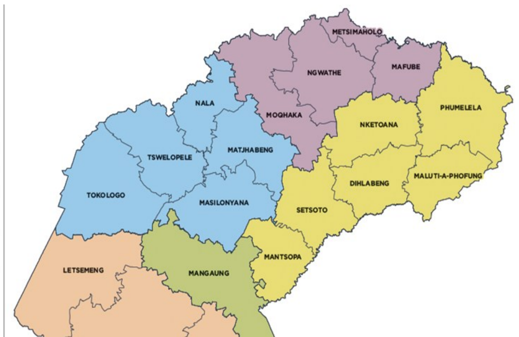
Figure 1: Mafube Local Municipality Locality Map

The locality of the target area is shown in Figure 1,