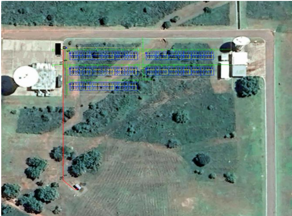
Fig 2: Plant 2 – 150kWp. Coordinates -25.886688, 27.705233, Area: 594m 2