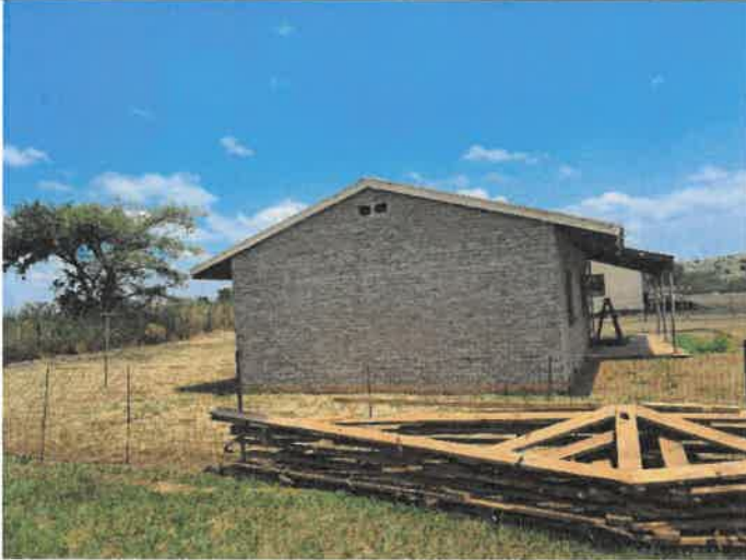
Side 6.740 m + (overhang 1.1 + 1.1 m)