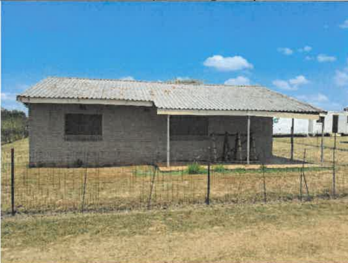
• Verandah = 7.00m