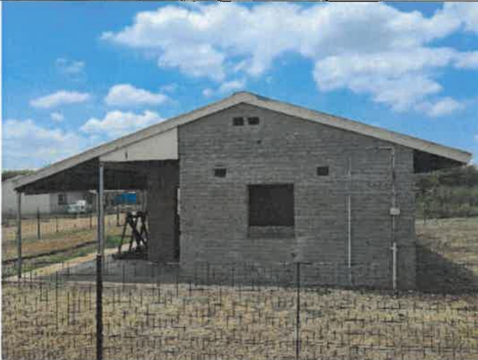
• Side = 9.240 m (Overhang 1.1m)