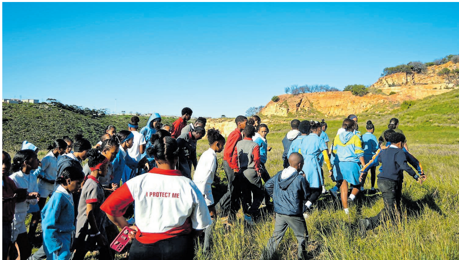
Northern areas pupils participating in the Leaders in Training programme go for a hike

Throughout the programme, IPM encouraged pupils to recognise their self-worth, believe in themselves