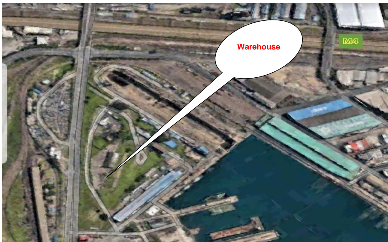
Figure A: Location of the Warehouse

The site where the Works will be executed is located within the existing TRANSNET Dredging Services Warehouse (Behind Shop 24), Bayhead Road, Bayhead, Durban. See below locality plan. Access to the works will be from existing public road networks and roads internal to the Dry Dock. Access to the Dry Dock will be through Bayhead Road into the Dry Dock entrance. Access will be subject to the Transnet National Ports Authority & Transnet Dry Dock security requirements and regulations.