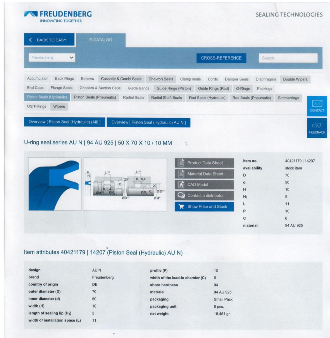
Figure 1: U-ring Piston Seal Datasheet

The supplier is responsible for the proper cleaning, packing and safe delivering of the goods to iThemba LABS (NRF) Stores, Cape Town.