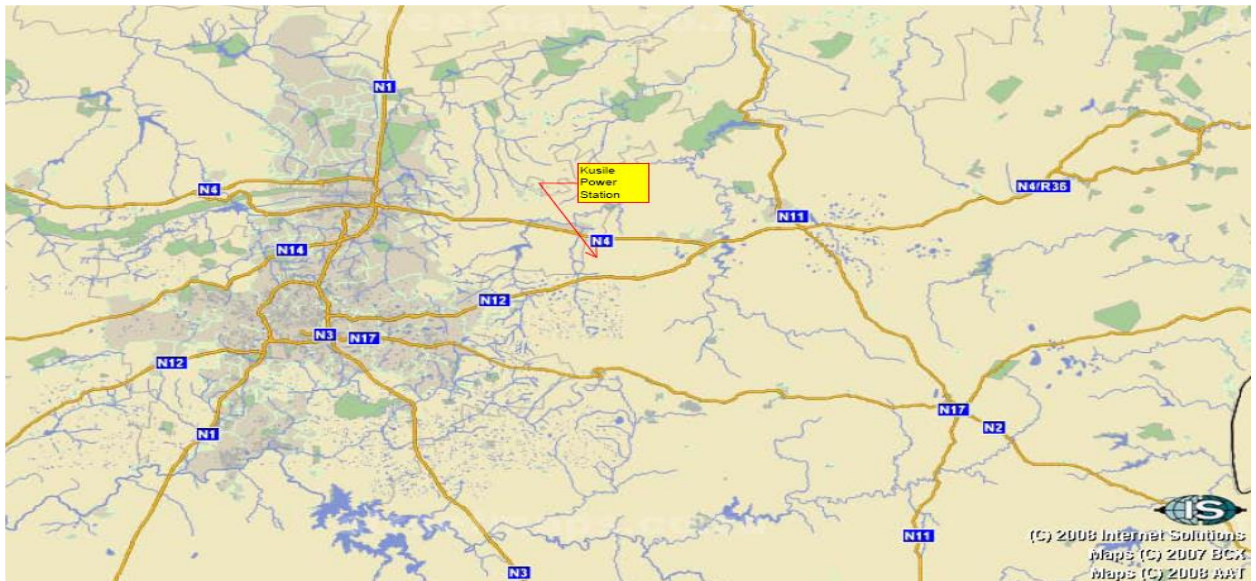
Figure 1: Locality Map of the Victor Khanye Municipality Area Between N4 and N12

The Power Station Site for Kusile Power Station is situated approximately in the area between Witbank and Bronkhorstspuit, between the N4 and N12 freeways. Figure 1 below shows the Power Station Site.