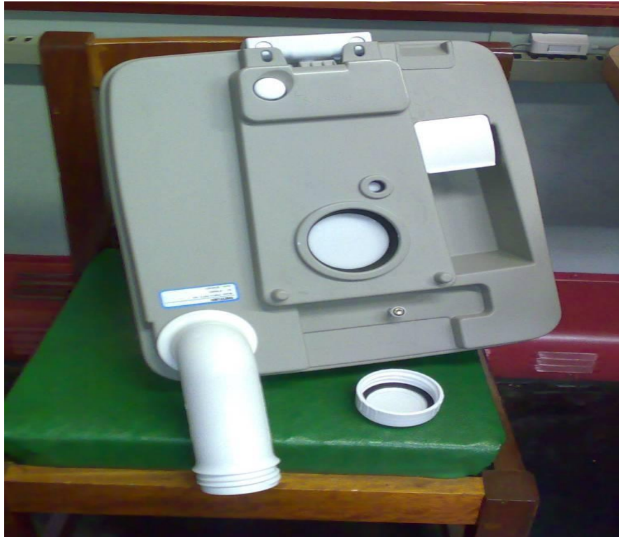
Figure 1.1- Porta Pottie