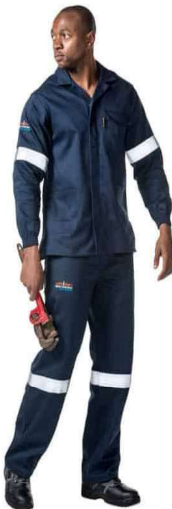
8. Flame and acid suit