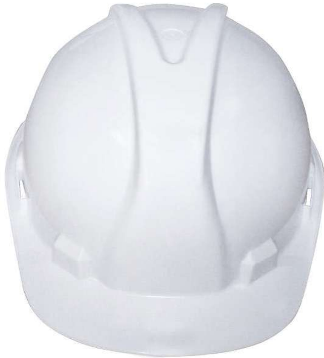
Hard Hat – SABS Approved (WA0001)