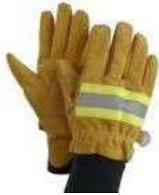
7. Fire Resistant Gloves Heavy Duty Leather Gloves – Yellow