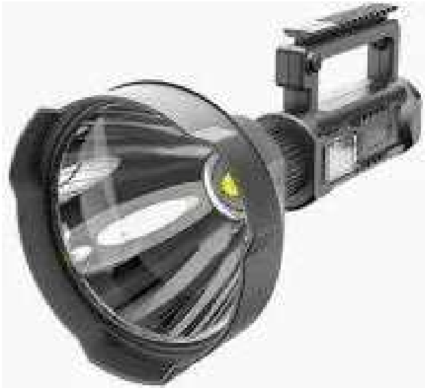
RECHARGEABLE LED SEARCH LIGHT RECHARGEABLE LED LIGHT 3 hr. Torch Emergency Light (Black)