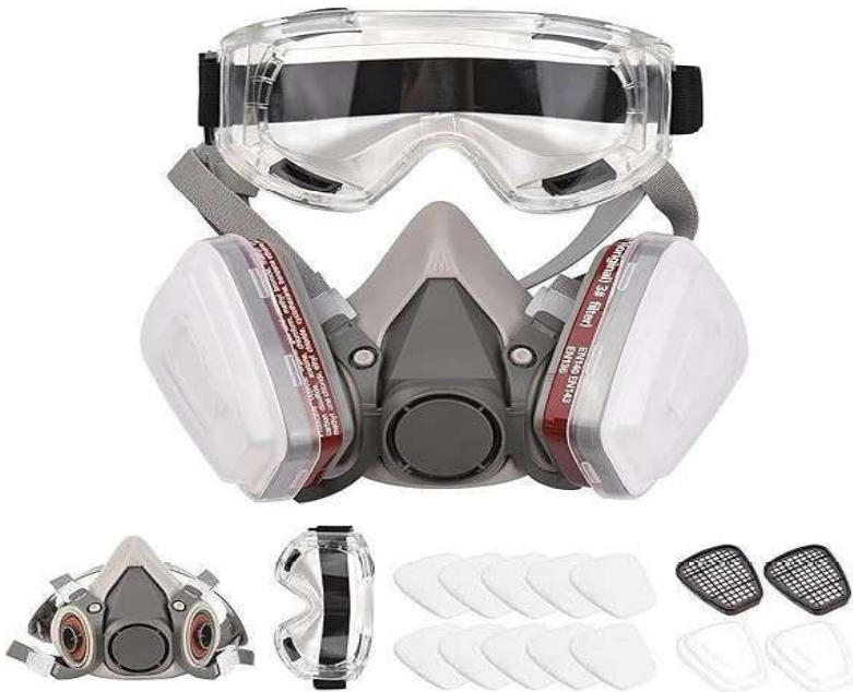
Sulfur Reusable Respirator Half Facepiece 6200 Gas Mask Breathing Protection Respirators with Safety Goggles for Painting Organic Vapor Welding Polishing Woodworking and Other Work Protection