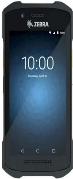
Zebra TC21 5 Rugged Handheld Mobile Computer – 4GB RAM, MicroSD, Android, Multi-Touch Display