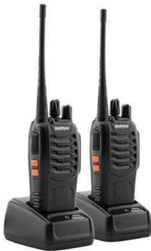
Professional Portable Two-Way Radio with earpiece FM Radio (Black)