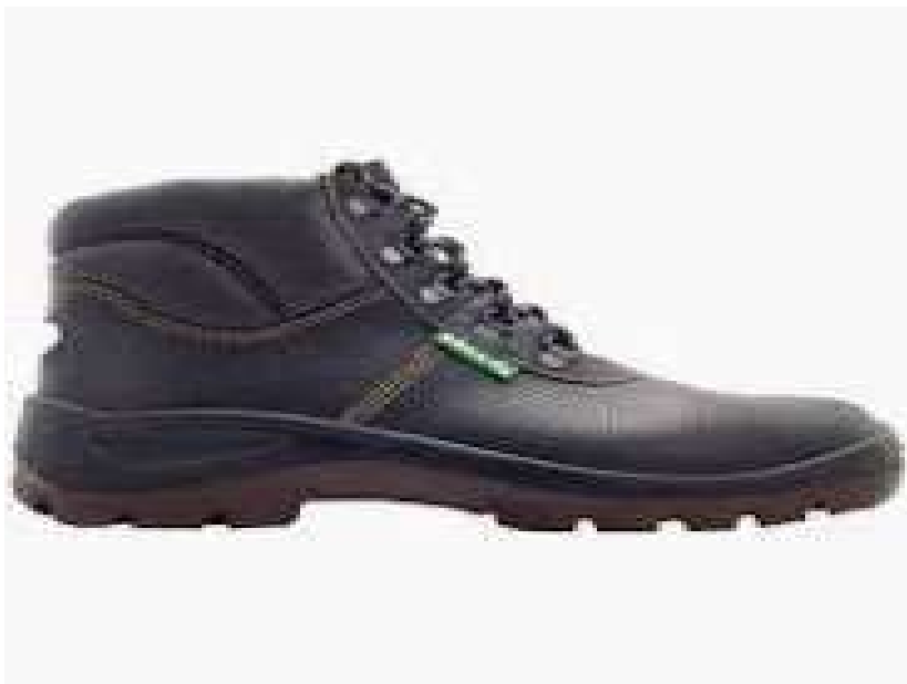
Dual Density PU/PU (Heat-resistant up to 95°C)