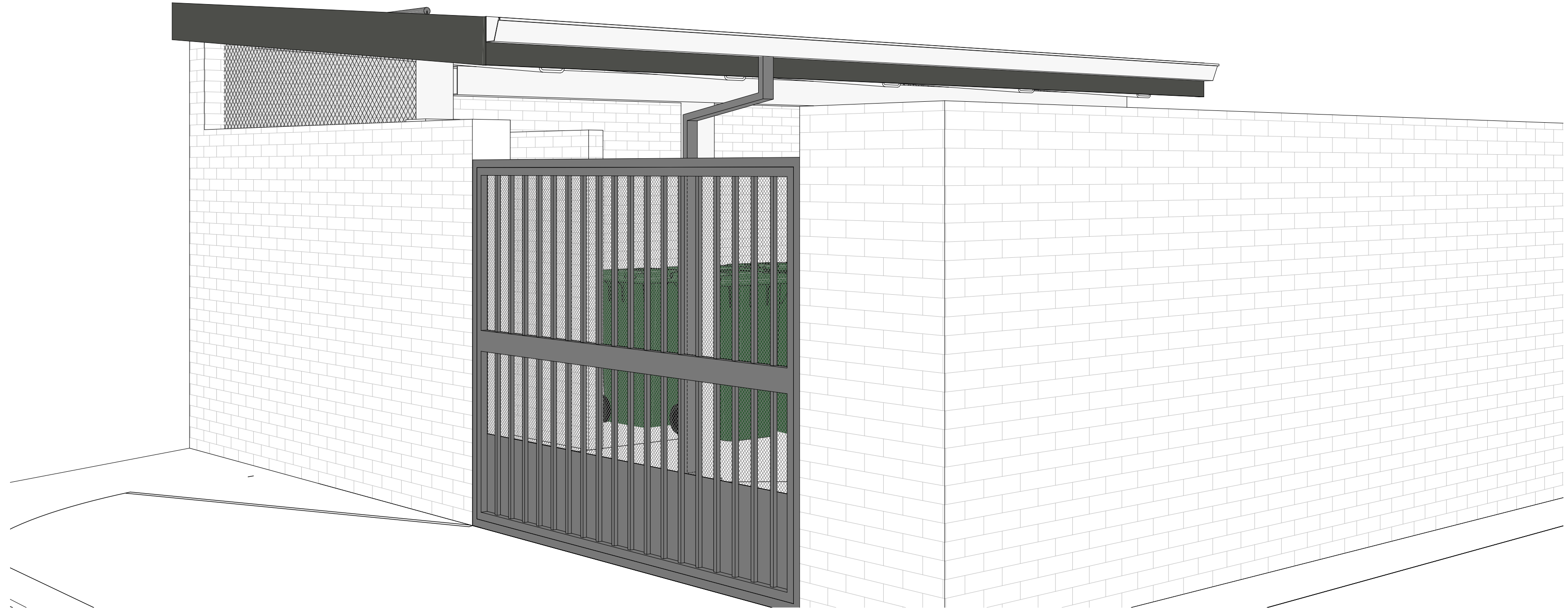
2 3D View 5