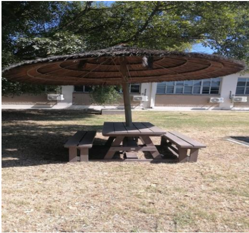
Location – D Block -Qty 2