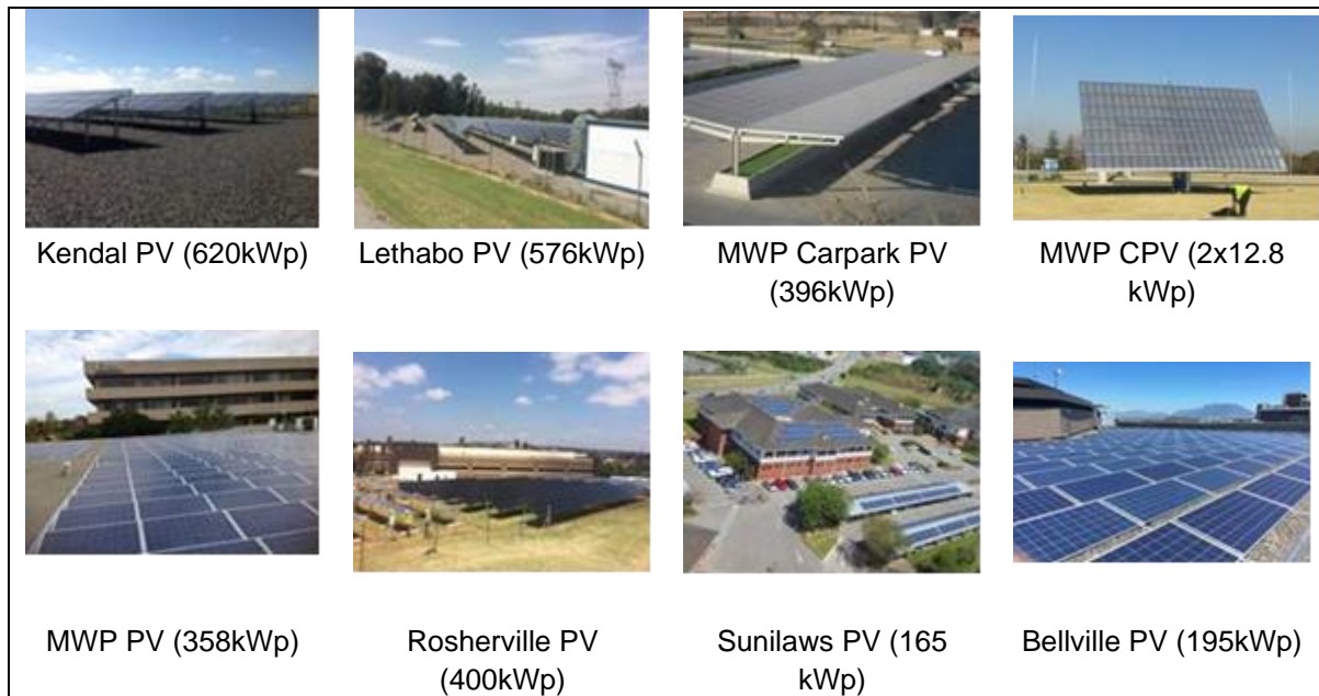
Figure 1: Installed PV Plants at Eskom