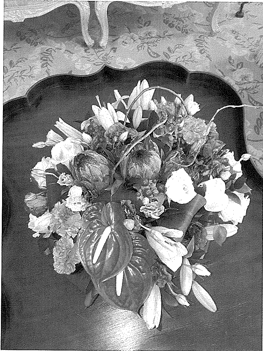
Example of colour