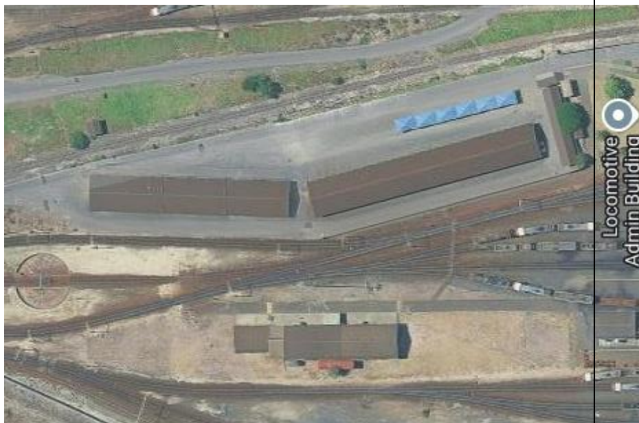
Figure 1: Bellville Locomotive Depot Overview