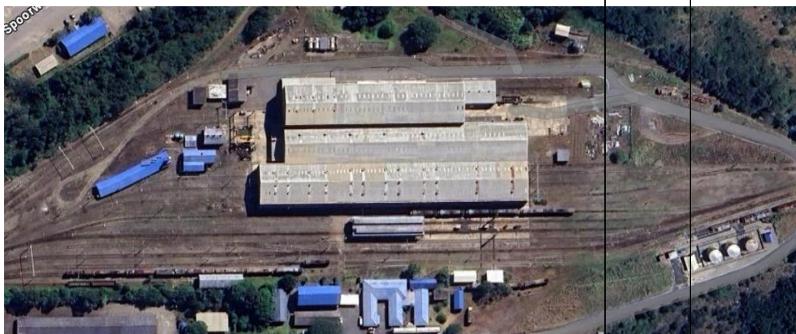
Figure 3: Cambridge Locomotive Depot Overview