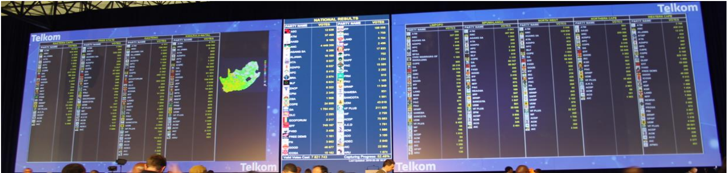
Illustration 1: Photograph of the 2019 results displays the central LED Display board

The following specialised equipment will be required: The Electoral Commission will use display boards at the National ROC to show the election results for the 2024 NPE. These boards will represent a summary of the overall results and will be the centrepiece of the operations centre. A mixed solution of both LED video wall and LED or Laser projection technologies is envisaged with LED technology displaying results data and projection technology showing supporting information in the form of computer generated tables, GIS maps and TV/video feeds as required. The specifications mentioned are the minimum requirements needed, the bidder should offer the best technical solution to provide the service.