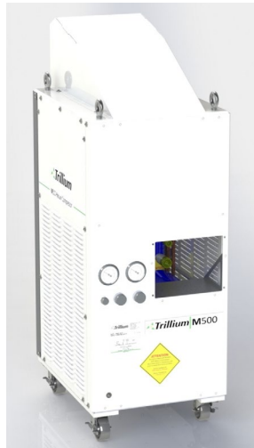
Figure 1: A photograph of the Helium Compressor

Scroll capsules are specialist, made-to-order parts. Each scroll capsule is integrated into a larger subsystem called the Helium Compressor. This Helium Compressor has been qualified as part of the MeerKAT array due to its performance specifications. The scroll capsule is required to be replaced in the existing Helium Compressor subsystem in order to return each to its original performance. Only the original equipment manufacturer (OEM) can qualify the Helium Compressor subsystem to operate with any other part. For this reason, no other equivalent part to that specified in this document will be accepted as a suitable alternative. The objective of this tender is to purchase 63 Scroll capsules to be fitted (by SRAO) on 63 MeerKAT Telescope Antennas.