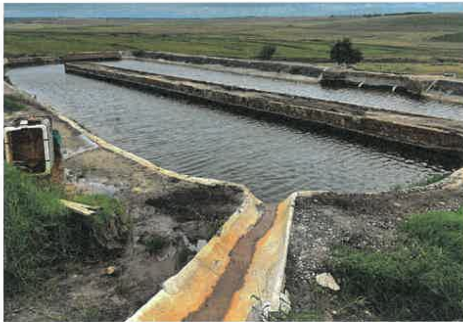
Figure 1. The CaroRAP System was constructed for the remediation of AMD in Carolina, Mpumalanga.

Passive treatment is recognised as a cost-effective and sustainable long-term treatment technique for the management of AMD in many parts of the world. A passive treatment system was commissioned in January 2021 by the CGS as part of its Mine and Environmental Water Management Programme. The system was designed to improve water quality by processes such as calcite dissolution to increase the pH and sulfate reduction to precipitate metals and sulfate ions as metal sulfide minerals. The treatment medium in the system is a mixture of commercially available compost and crushed limestone aimed at generating alkalinity and reducing sulfate to sulfide. The system has been operational since January 2021 and its performance has been monitored on a regular (mostly twice a month) basis.