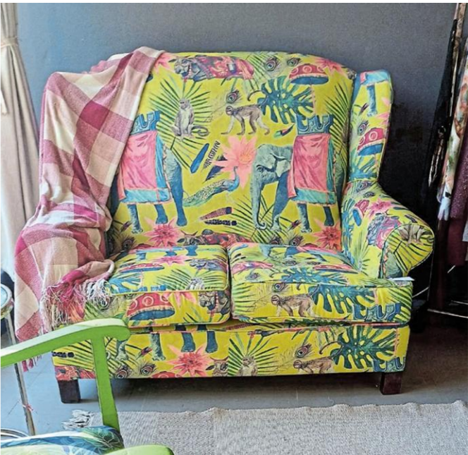
FUNKY NOW SPUNKY: A vintage intimate two-seater gets a colourful makeover, and now the new owner is a trendsetter.