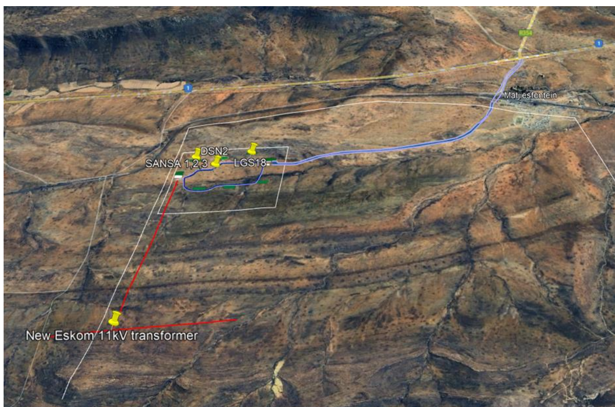
Figure 1: Site position on the map