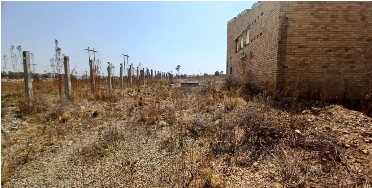
Figure 4 Vandalized tie-station indoor