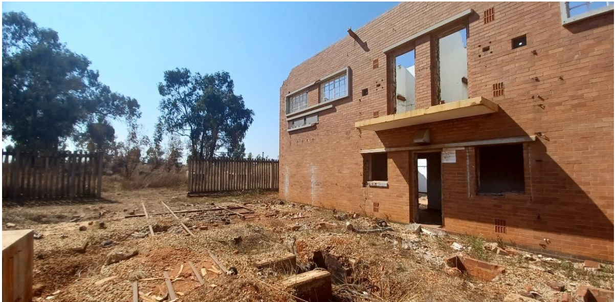
Figure 2 Vandalized substation building