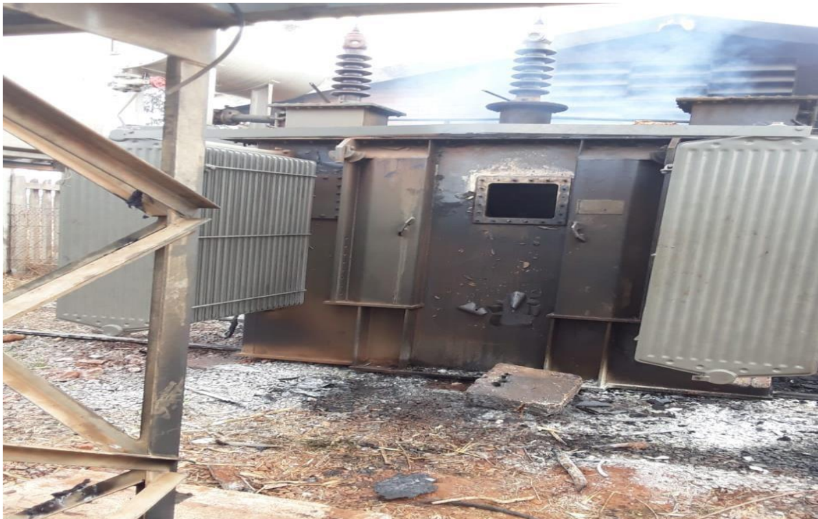
Figure 1: Vandalized traction transformer

The present status quo for vandalized substations and equipment are depicted in the pictorial format below.