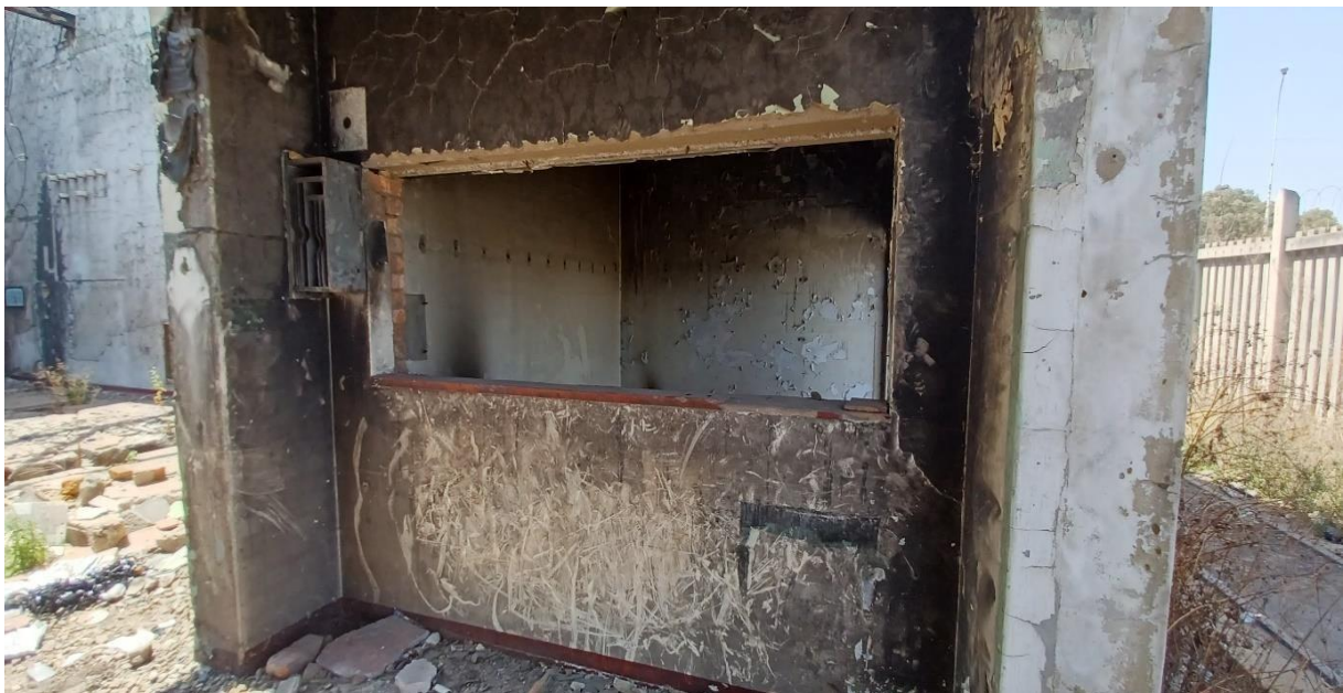
Figure 5: Tie-station