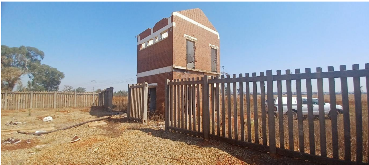
Figure 3: Vandalized 3kV Eskom outdoor building