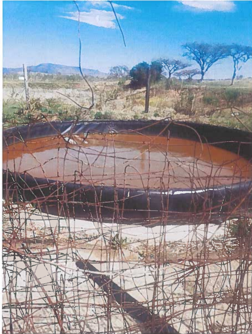
Leachate pond one