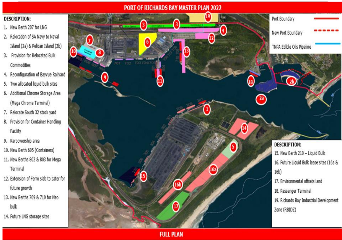
Figure 2: Port of Richards Bay Master Plan

4.1 The proposed Liquid Bulk sites within the South Dunes Precinct is aligned to the Master Plan for the Port of Richards Bay (Item Number 16a & 16b).