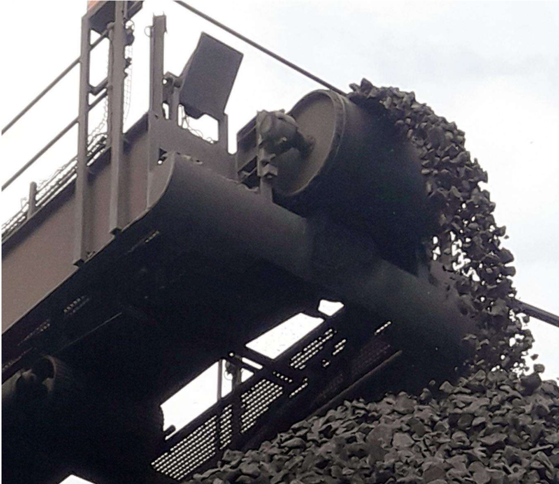
Fig 1: B-Stacker head pulley at PEMPT

The Port Elizabeth Multi-Purpose Terminals (PEMPT's) core business is to export dry bulk manganese ore. This is achieved by utilizing various terminal infrastructure such as rail wagon tippers, feeders, conveyor belts, storage facilities, ship-loaders, reclaimers and a network of mobile equipment such as excavators and bulldozers. PEMPT has approximately 10 kilometers of conveyor belt which conveys the ore from the Tippers to the ship loaders. The conveyors have pulleys, which require periodic change outs and refurbishments when damaged. This scope is for the manufacture, supply and delivery of twenty (20) conveyor pulleys.