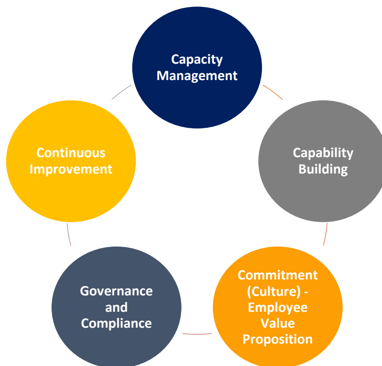
5C of City Power's HR Strategy

The HR strategy plays a key role in the realisation of the benefits of the new operating model and overall business direction as it will see the optimal resourcing of key operations. To be able to achieve this, the HR strategy is underpinned and shaped by the following key factors (5Cs):