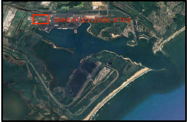
LOCALITY PLAN - NTS