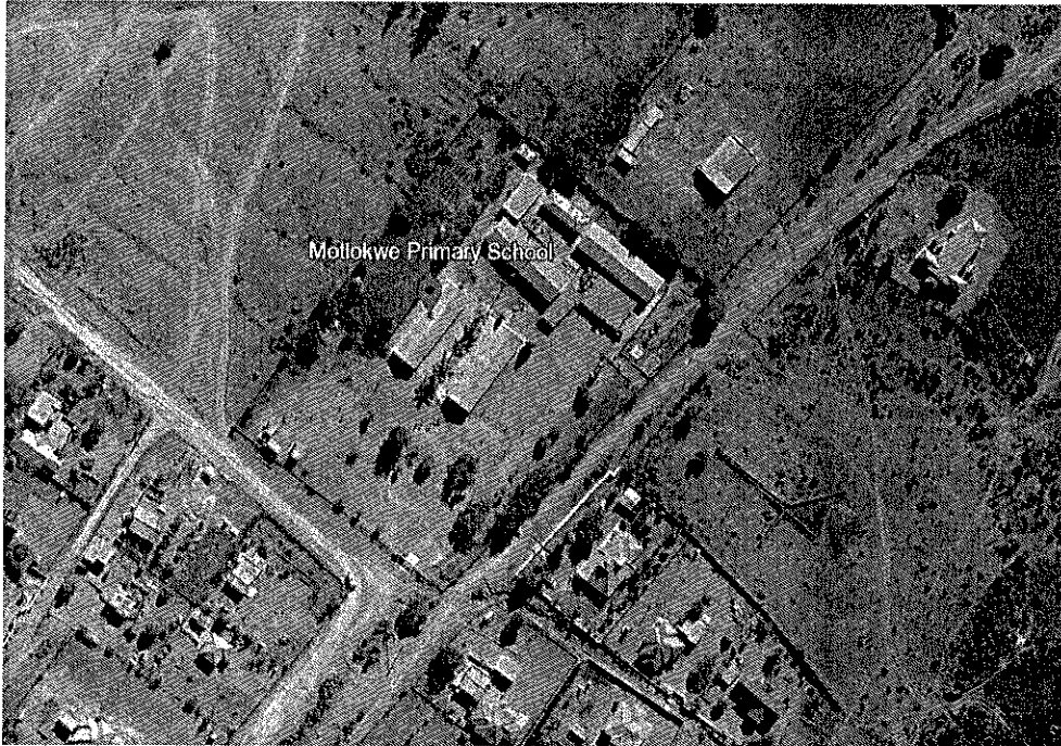
Figure 1: Locality