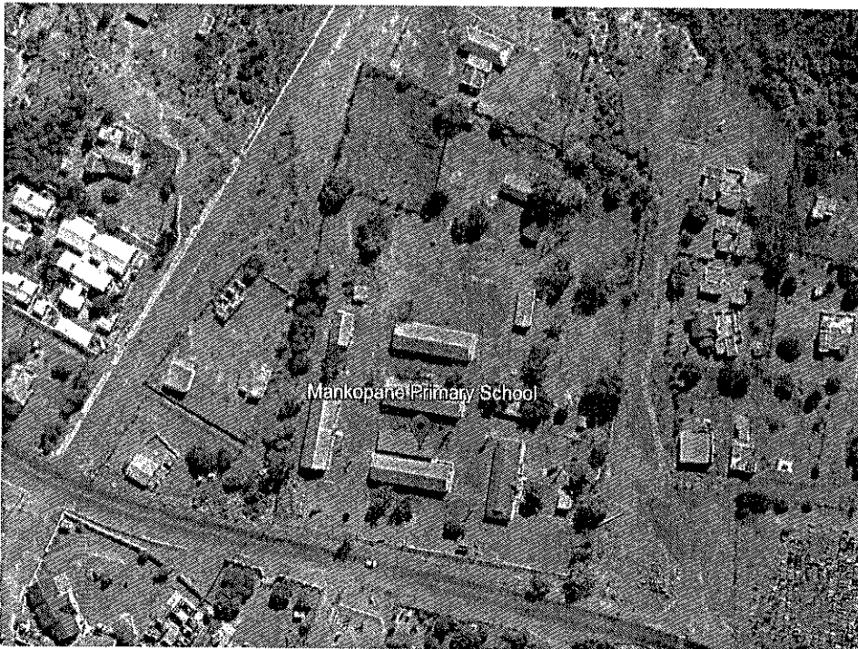
Figure 1: Locality