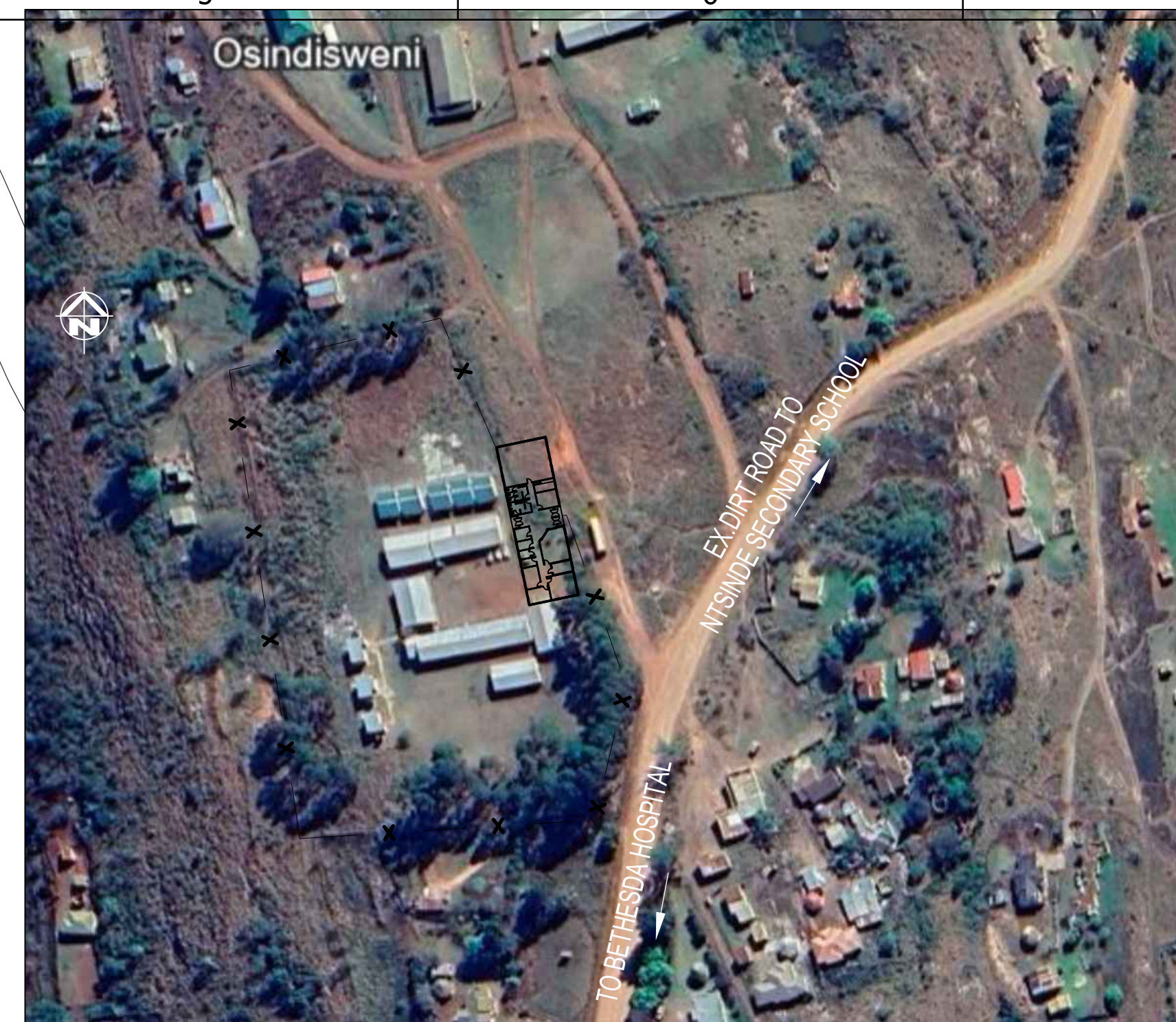
SITE AERIAL IMAGE