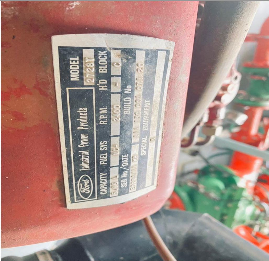
Existing water Pump in Quaggasnek