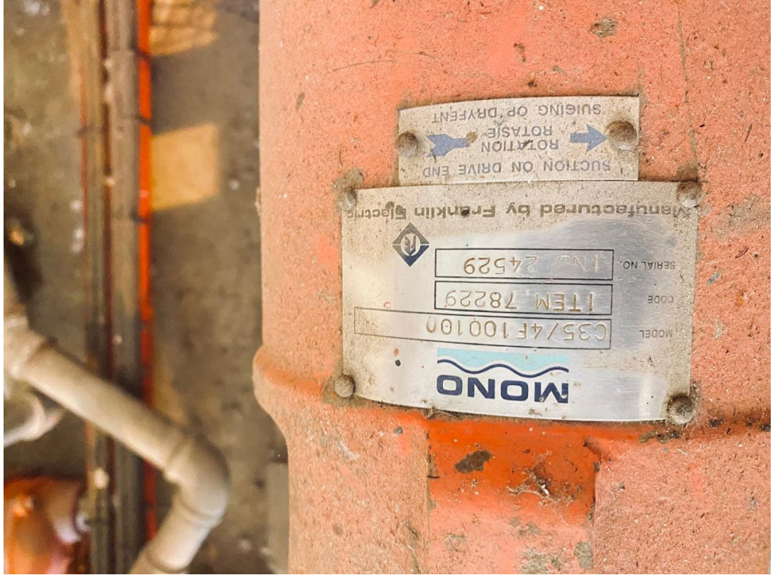
Quaggasnek Pump Station