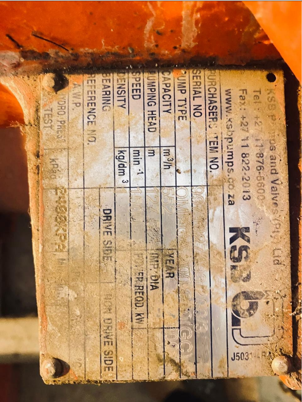
The existing water pump for Hilltop.