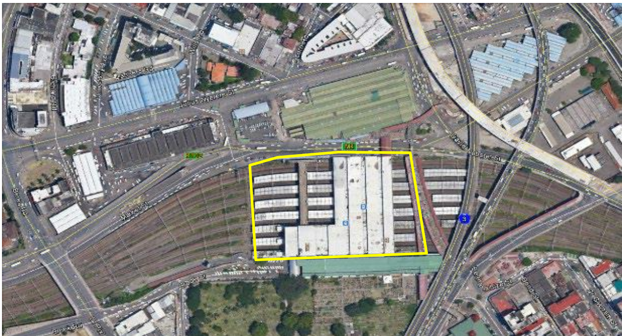
Figure 1: Berea Road Station – site identified for commercialisation

The Station has entrance points via the Skywalk over Market Street and two long staircases from opposite ends of Badsha Peer Square (Brook Street). The retail trading area is located on top of the overhead lines in the first-floor level above the train platforms.