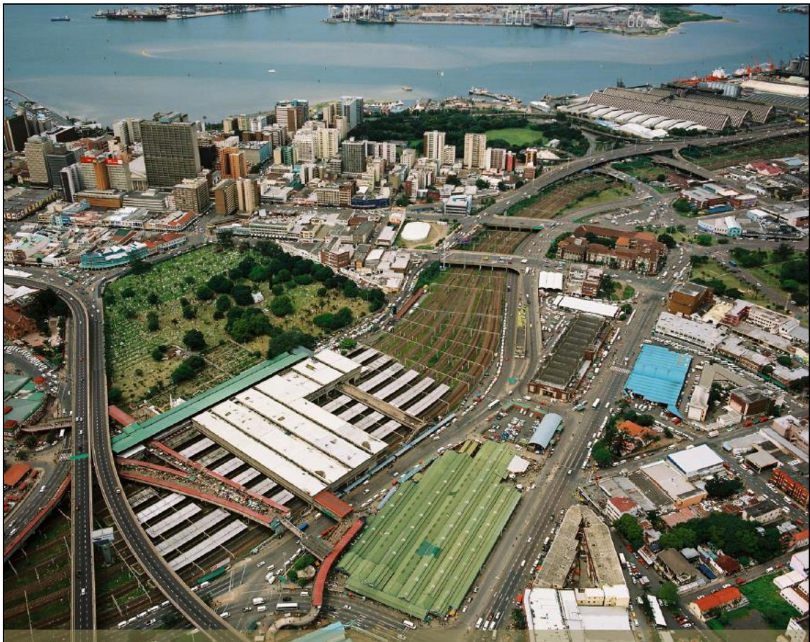
Figure 1: The Berea Road Station south elevation aerial view

The Berea Road Station is located in the Warwick Triangle Precinct and forms part of the important transport network and is on the western gateway to the city of eThekweni.