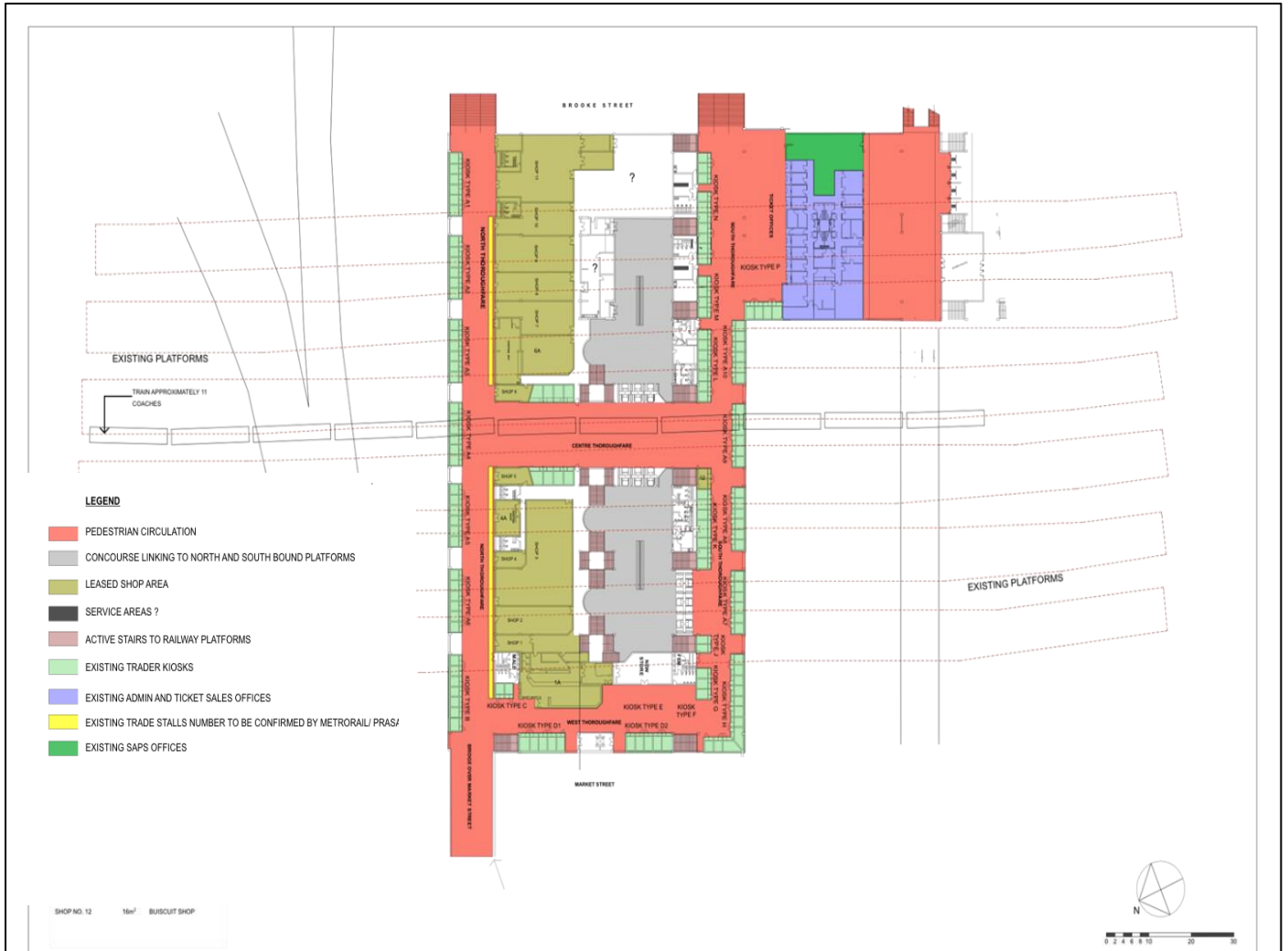
Figure 3: Existing Berea Station Concourse level