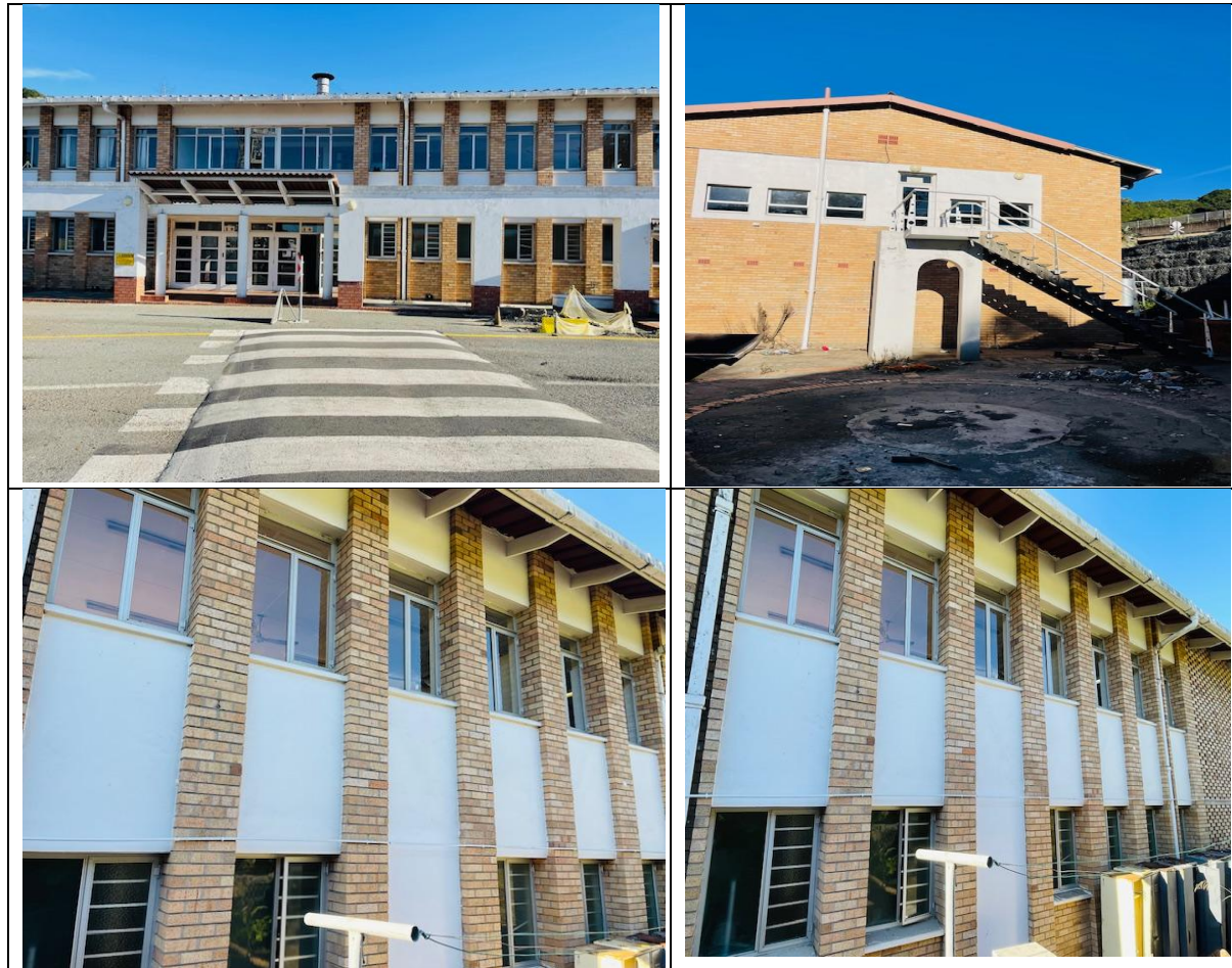
Table 1: Windows and Doors requiring the installation of the burglar bars at the Manhattan Building

DESCRIPTION OF WORKS: SUPPLY AND INSTALLATION OF HEAVY-DUTY GRADE 316 STAINLESS STEEL BURGLAR BARS FOR WINDOWS AND DOORS AT MANHATTAN BUILDING, AND SUPPLY AND INSTALLATION OF HEAVY-DUTY GRADE 316 STAINLESS STEEL ROUND TUBING BALCONY HANDRAILS AT PORT CONTROL BUILDING IN THE PORT OF EAST LONDON FOR A PERIOD OF SIX (6) WEEKS.