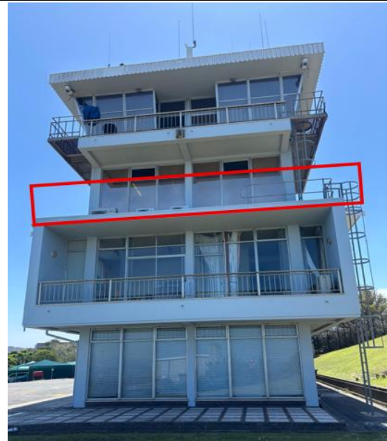
Figure 3: Port Control Balcony Section