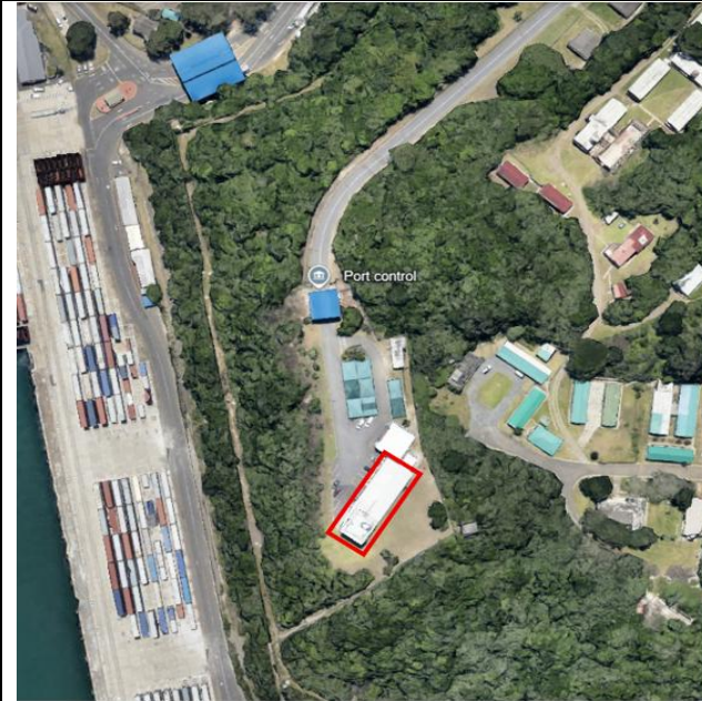
Figure 2: Port Control Building Site Location

DESCRIPTION OF WORKS: SUPPLY AND INSTALLATION OF HEAVY-DUTY GRADE 316 STAINLESS STEEL BURGLAR BARS FOR WINDOWS AND DOORS AT MANHATTAN BUILDING, AND SUPPLY AND INSTALLATION OF HEAVY-DUTY GRADE 316 STAINLESS STEEL ROUND TUBING BALCONY HANDRAILS AT PORT CONTROL BUILDING IN THE PORT OF EAST LONDON FOR A PERIOD OF SIX (6) WEEKS.