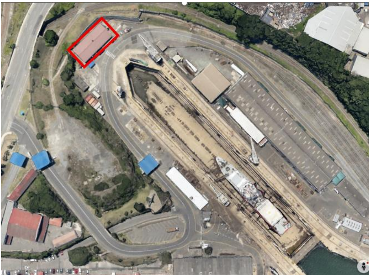
Figure 1: The Manhattan Building Site Location

The site is located on the East Bank of the Buffalo River, at the Port of East London, near the Princess Elizabeth Graving Dock (Dry Dock) area. The area forms part of the operational port infrastructure and is under the jurisdiction of the Transnet National Ports Authority (TNPA).