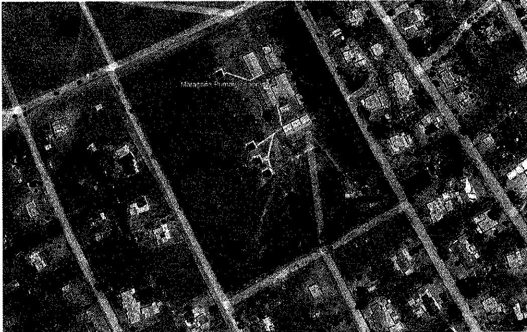
Figure 1: Locality