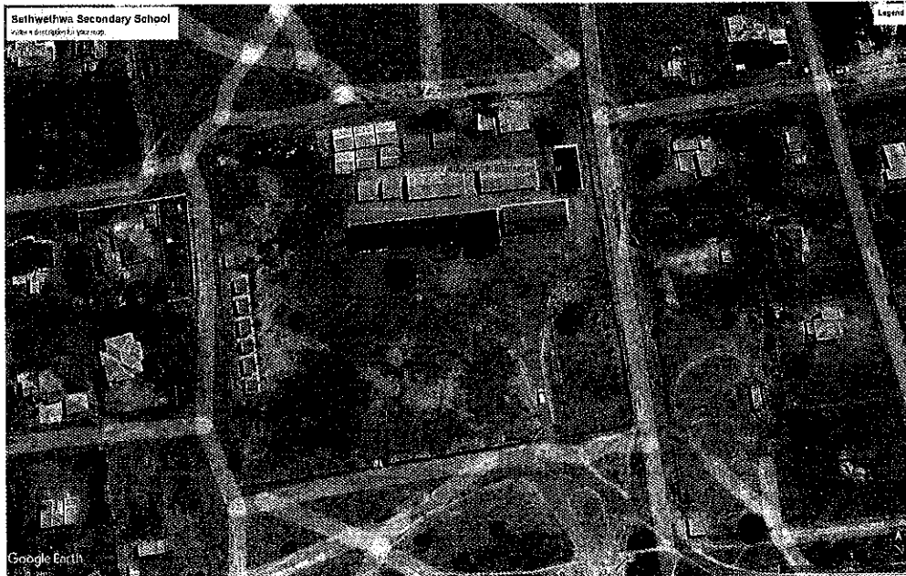
Figure 1: Locality

Coordinates: 24°21'47.60"S 29°22'29.61"E.