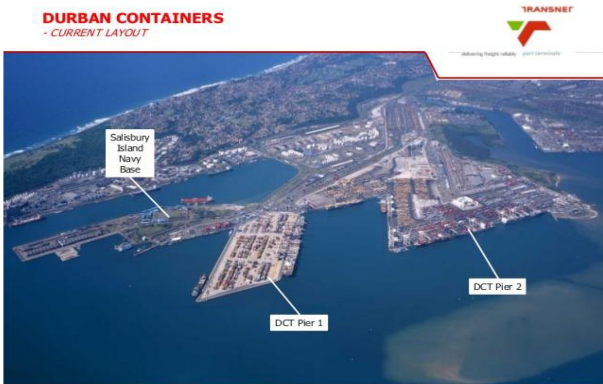
Figure 1 show the map of Durban Container Terminals (Pier1&2)

The Durban Container Terminals are currently facing a challenge of chemical /hydrocarbon spillages that occur during operational activities either on board vessels, in the yard, and the workshop areas. The terminals do not have the competency and resources to manage the different type of spillages (chemical and Hydrocarbon), and workshop related activities i.e., jetting of drains. This makes the terminal exposed to being non-compliant with compliance obligation requirements which may result in notices, charges/ fines, and ultimately closure of the business operations.