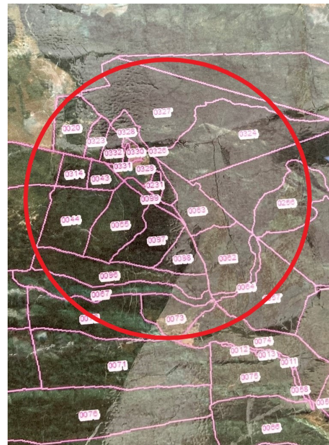
Figure 4. Potberg section – mini compartment Nbal numbers encircled and as tabled.