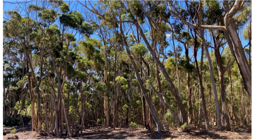
Figures 1 & 2. Examples of unmanaged blue gum tree woodlots for harvesting at the Potberg section within the De Hoop Nature Reserve.