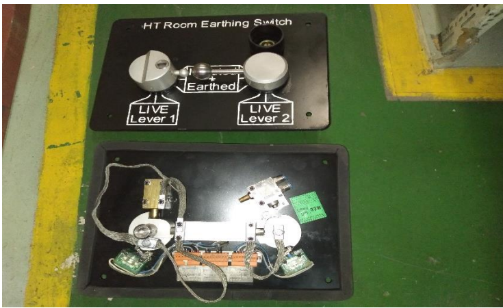
Fig 4 – 10M HT Room Earthing Switch