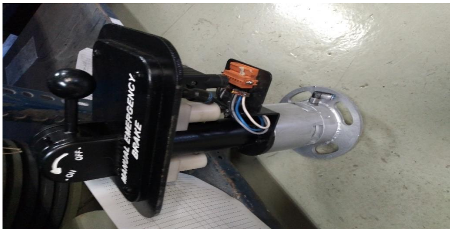
Fig 3 - 10M Emergency brake valve