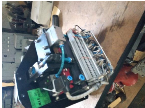
Fig 1 - 10M5, Single hand master controller