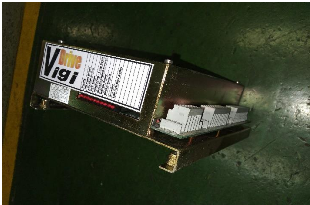
Fig 2 - Vigi drive