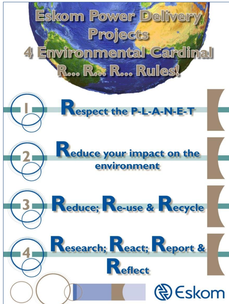
Figure 2: Eskom Transmission Projects Delivery – Environmental Cardinal Rules

The TPD Waste Management Strategy for solids and liquids aims to provide for waste minimisation, re-use and recycling strategies where sustainable, practical and feasible; to those associated waste with construction activities.