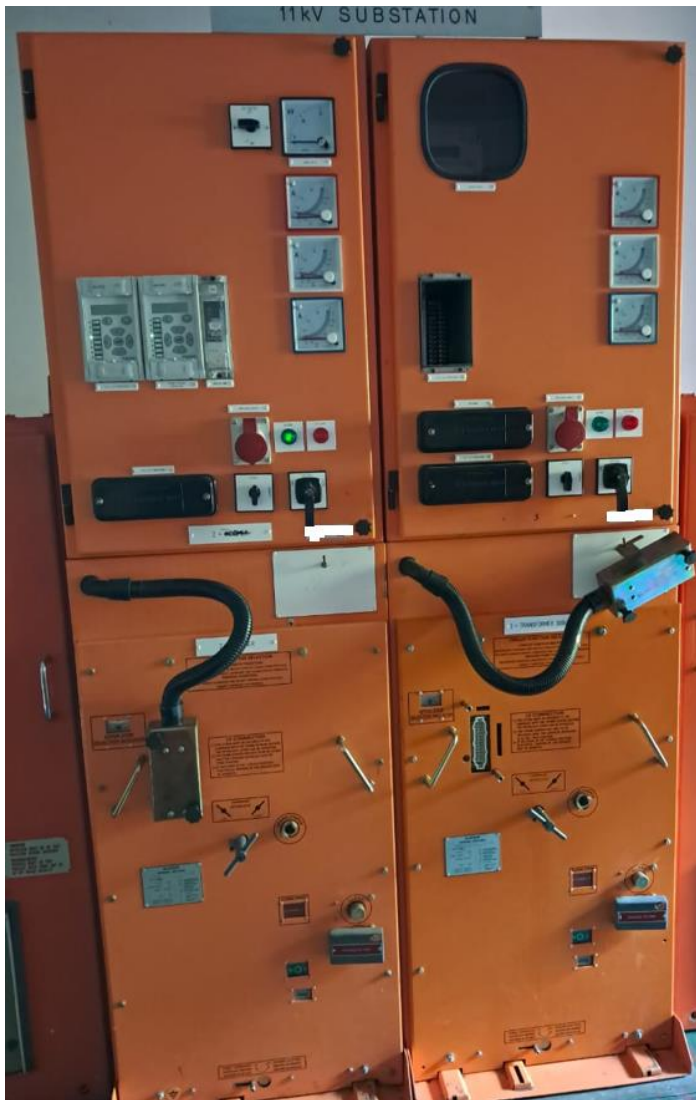
Fig. 1 – 11KV switchgear (required set up)