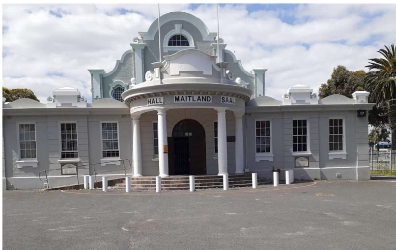
MAITLAND HALL – 213 VOORTREKKER ROAD, MAITLAND

CITY OF CAPE TOWN URBAN MOBILITY DIRECTORATE: TRANSPORT INFRASTRUCTURE IMPLEMENTATION CONTRACT NO. DP5558Q/2019/20 UPGRADE OF VOORTREKKER ROAD, FROM 4th AVENUE TO 12TH AVENUE, MAITLAND