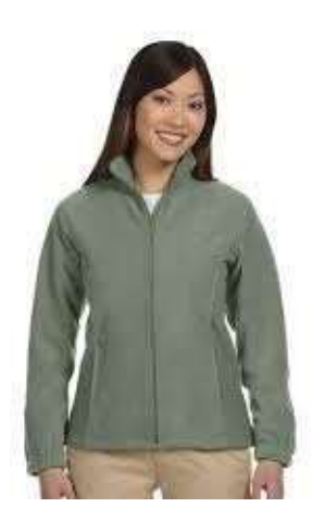
Sample poly fleece jacket