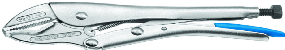
VICE GRIPS CHROME VANADIUM