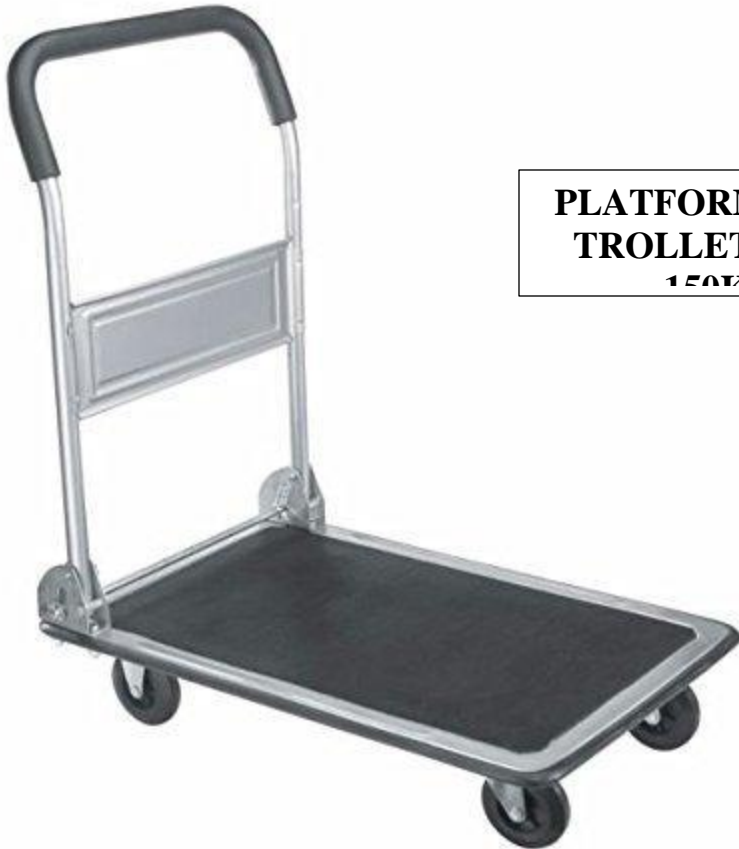
PLATFORM HAND TROLLEY FOR 150KG