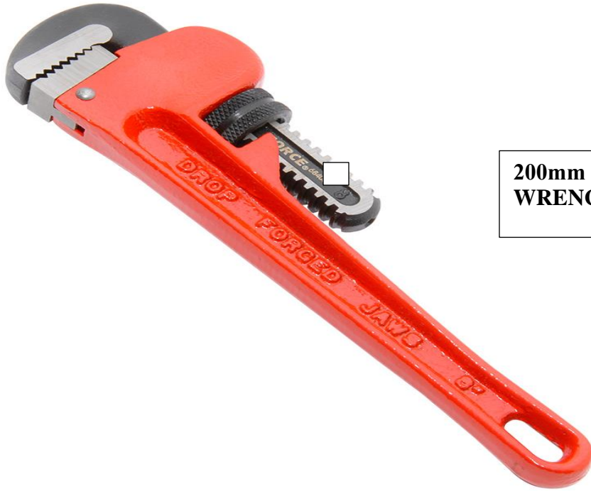
200mm 8'' PIPE WRENCH