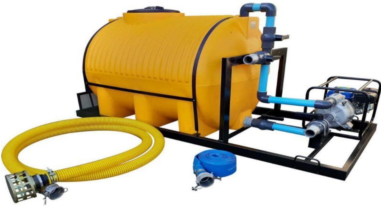
HORIZONTAL TANK HONEY SUCKER