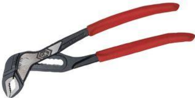
175mm WATER PLIER