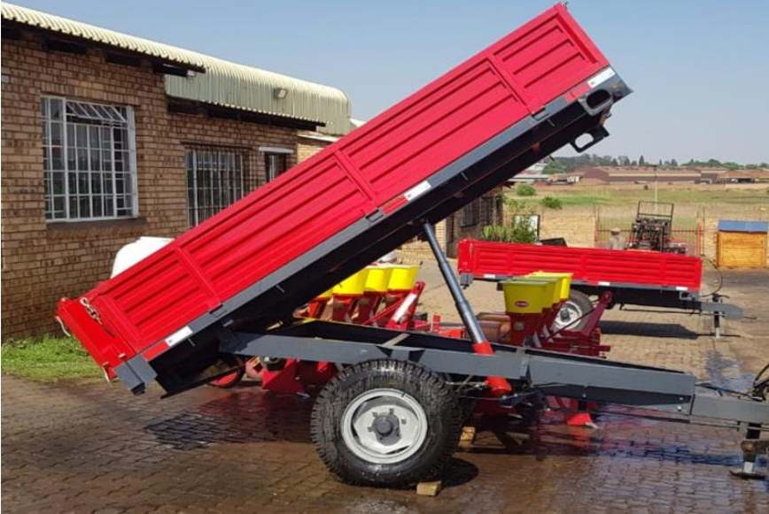
TRAILER FOR THE TRUCK