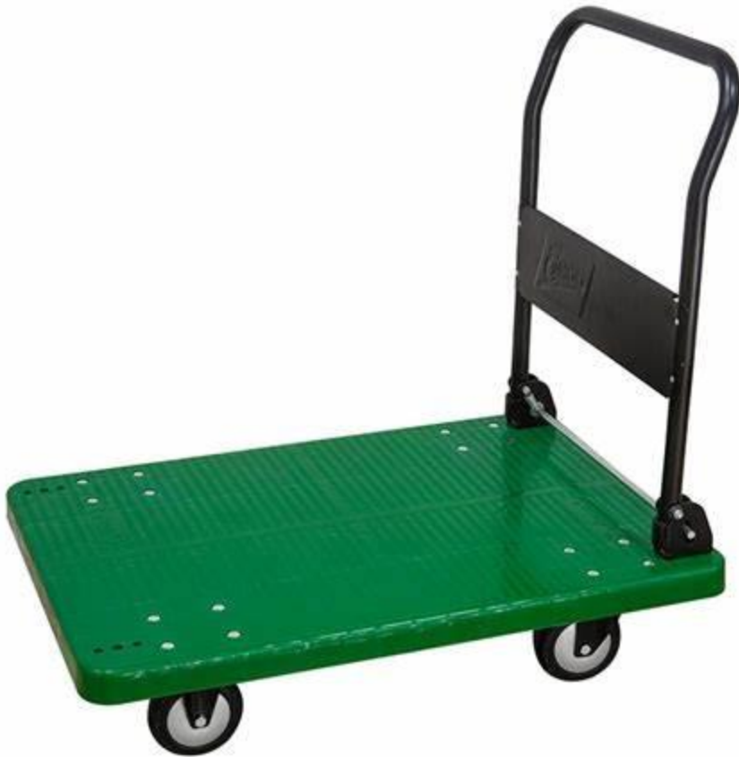
PLATFORM HAND TROLLEY FOR 300KG