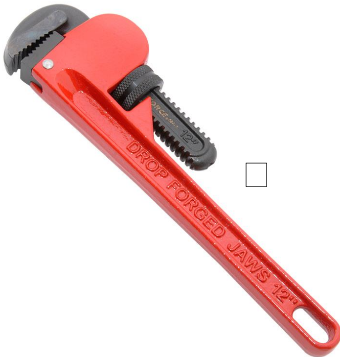
300mm 12'' PIPE WRENCH