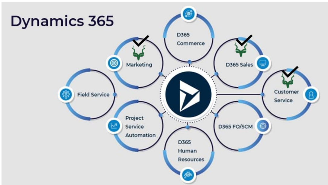
Figure 1 – D365 CRM modules activated for SANParks

SANParks has activated the Customer Service, Marketing and Sales modules of D365 CRM.