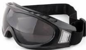
Picture 3: Anti-UV (dark) safety glasses (Dust, wind and sand proof).

Anti-UV (dark) dust, wind and sand proof safety glasses will be allowed on the project due to the work activities that is happening in sunlight.