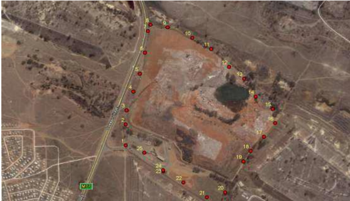
Figure 5: Locations of subsurface probes and boreholes currently at Marie Louise landfill site.

Marie Louise is located along Elias Motsoaledi Road, Dobsonville, Soweto. The landfill covers 44 hectares and surrounding land is mainly used for industrial, residential and mining purposes. The eastern and southern slopes of the closed cells have a final cap although most of the surface is covered with a temporary thin layer of soil (mostly builders' rubble). Currently there are 10 subsurface probes on the site.