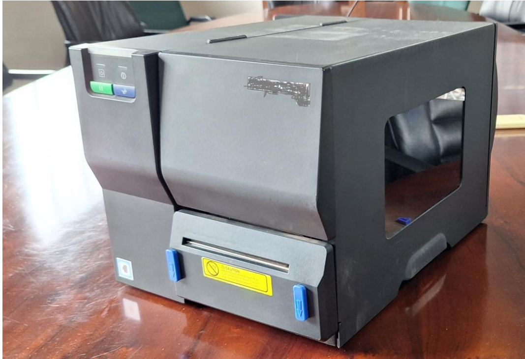
Figure 1: Industrial Barcode printer