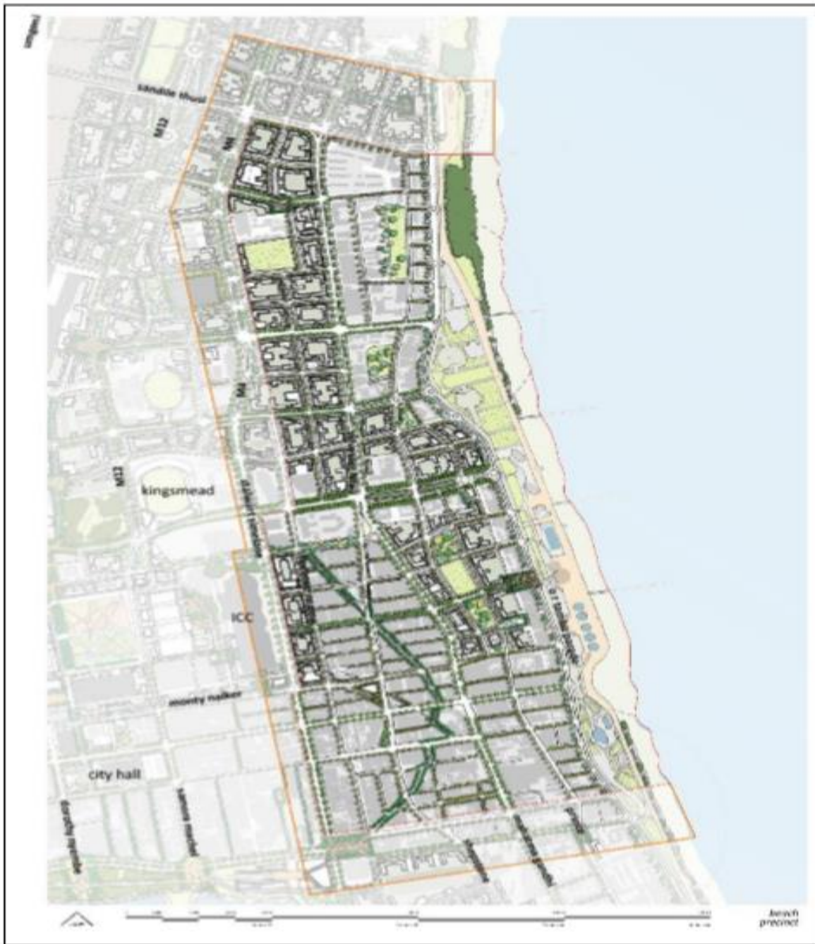
Figure 83: Beach Precinct Vision