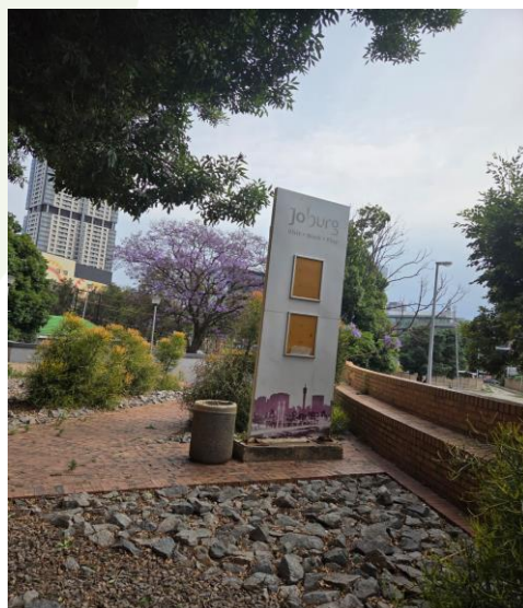
Front and back of the pylon signage