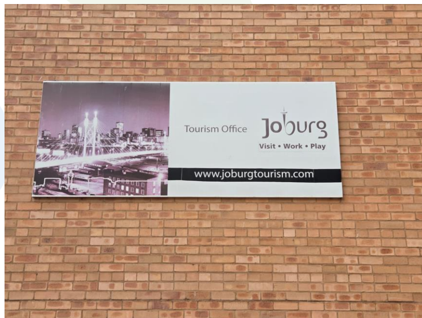
Image: Side wall of the Sandton Library signage