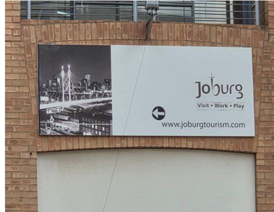
Image: Front of the Sandton library signage