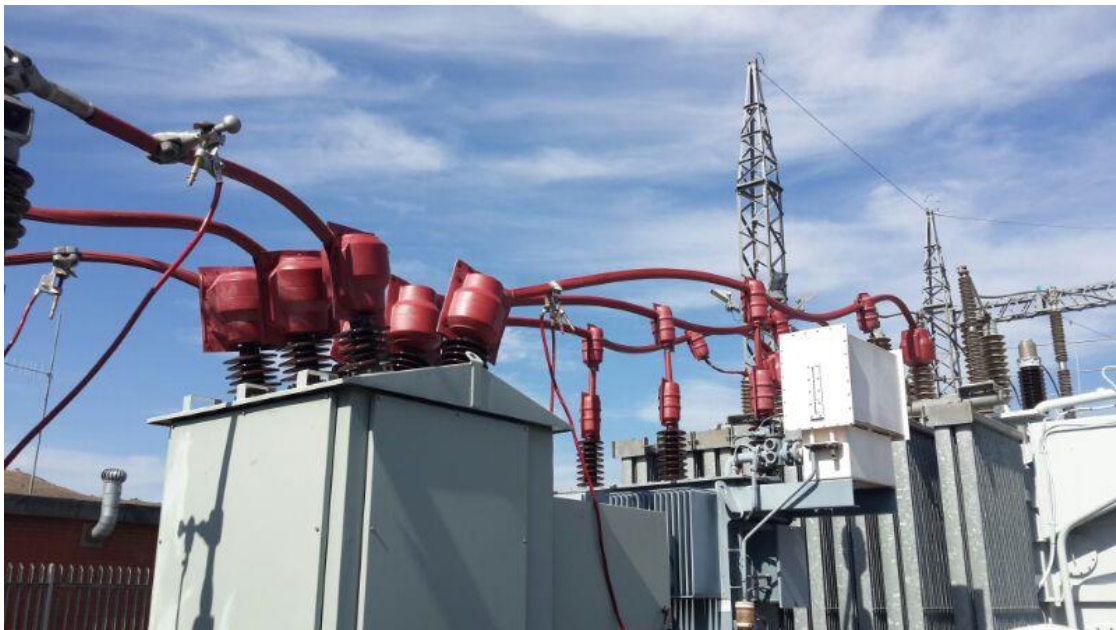
Figure 3: Substation with wildlife protective covers installed