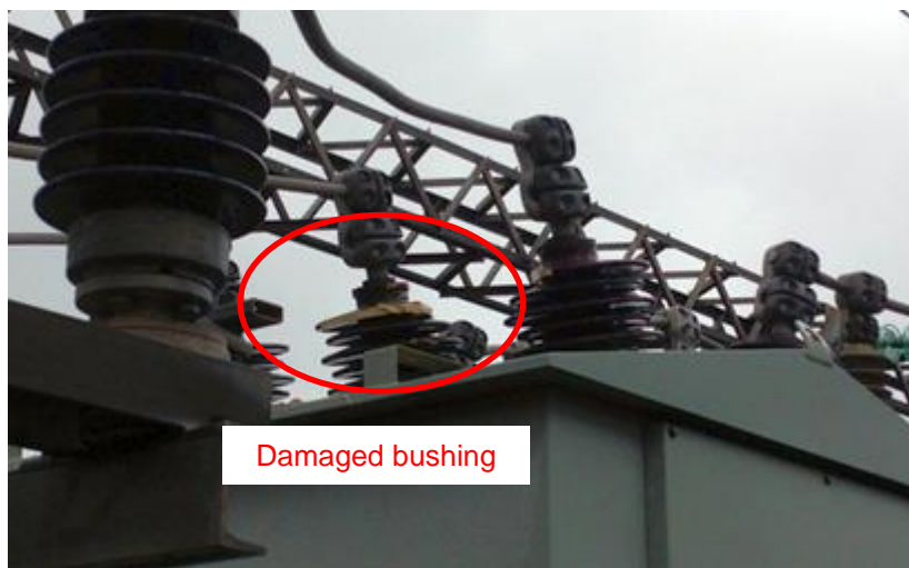
Figure 2: Bushing damaged following monkey making contact with live ends