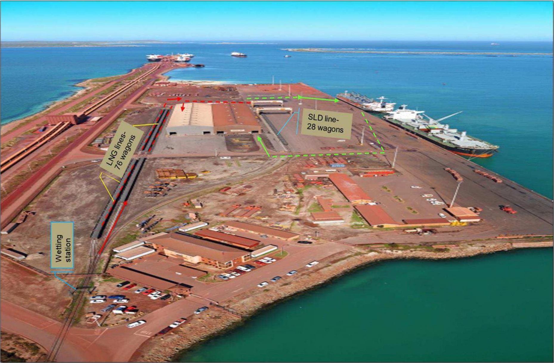
Terminal View – Manganese Facility Layout